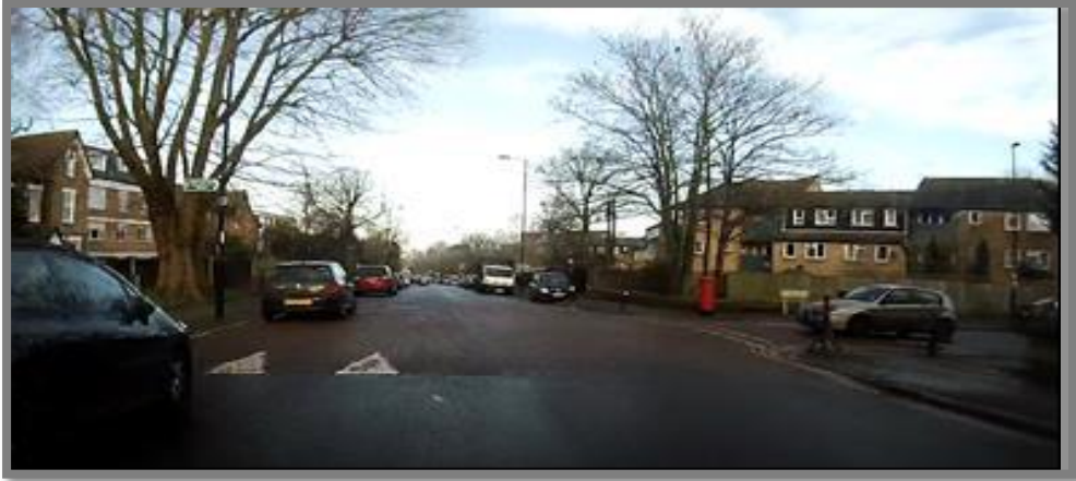
Speed table (£32,000)